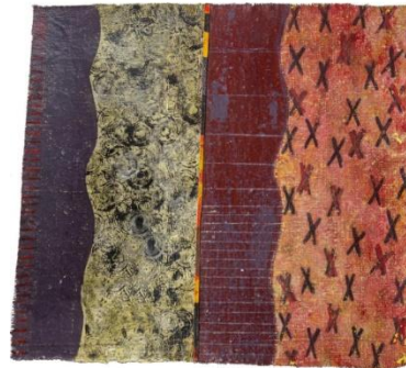
Wanda Medina, Untitled , 2019; Latex and mixed media on burlap.