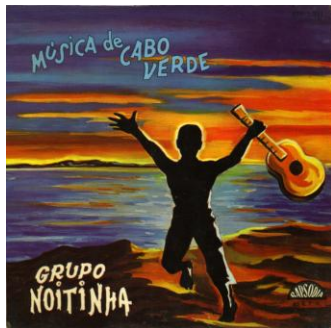
Grupo Noitinha, Musico de Cabo Verde , 45 rpm record, ca. 1960. Published in Porto, Portugal by Discos Rapsodia.

This project highlights the rich Cape Verdean culture and explores continuing connections with Cabo Verde, affirming its importance to our region's history and future. This project will illuminate stories and diverse histories of Cabo Verde, and the broad cultural and social threads that weave together a distinctively Cape Verdean American identity, as reflected throughout the community.